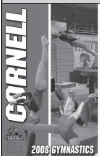
On The Covers: Front (clockwise from top right): Colleen Davis '07, Stacey Ohara '08, Megan Gilbert '07.

The department promotes pride and unity within the university community and provides opportunities to develop, strengthen and maintain ties to external audiences such as alumni, friends, the educational community, and the general public by attracting interest, recognition and support.